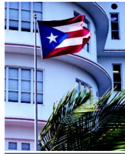
We're experts in shipping to Puerto Rico. After all, we've been doing it for more than 30 years.