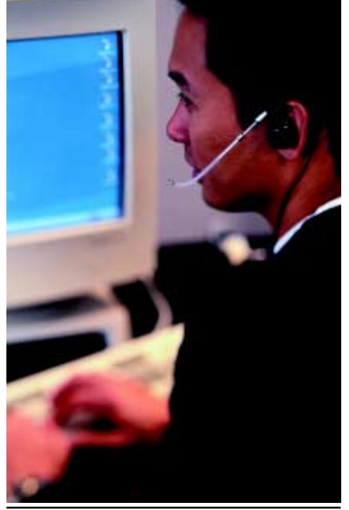
Our experienced staff ensures you of efficient, personal service from start to finish.

Or we can arrange to receive multiple orders from numerous