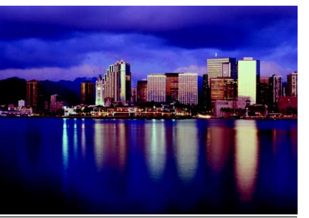
We offer both LCL and FCL service from all West Coast ports to Honolulu, as well as barge service to the outer islands.

So the next time you need help getting product to Hawaii or Guam, do what a variety of local companies do: call the logistics experts at American Fast Freight.