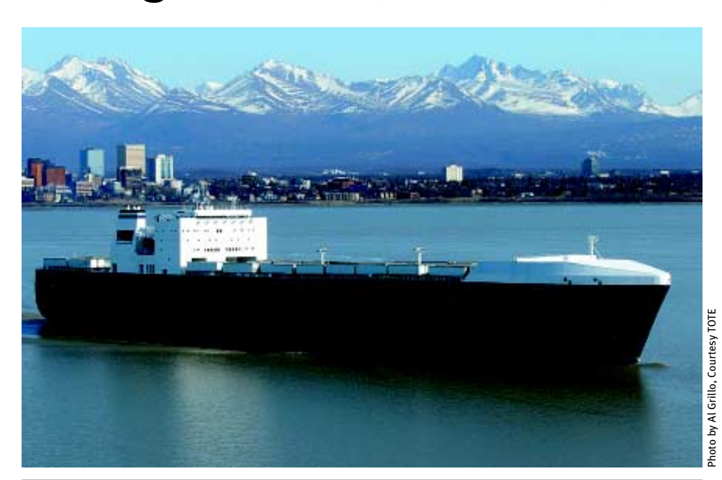
Our receiving and loading terminals in Seattle, Tacoma, Oakland, Los Angeles, and Chicago expedite your shipments to and from Alaska.

As a pioneer in solving transportation problems, we have developed sophisticated distribution systems using all modes of transportation to and within Alaska.