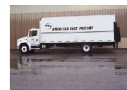
Through a network of contract trucking, intermodal rail, and air freight forwarding partners, we provide seamless transportation from start to finish

Most cargo headed for Alaska arrives on steamships through the Port of Anchorage. Each of the lines serving Alaska has two weekly departures from the Seattle-Tacoma area, with transit times of three days. Barges serve other areas of Alaska, with transit times of 10 to 21 days.